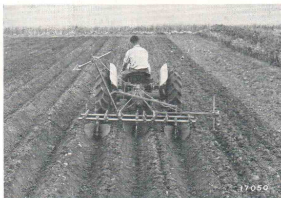
Ridging with the C66.